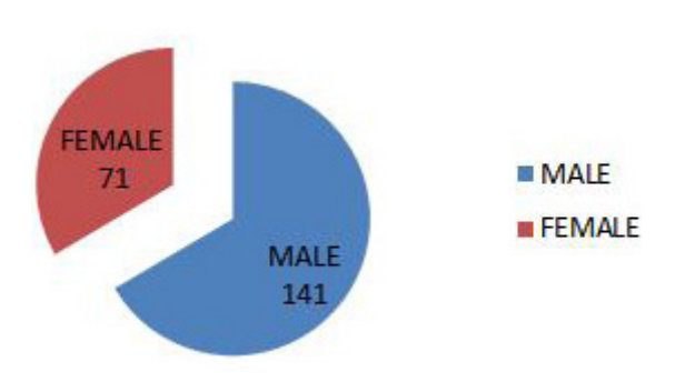
Figure 1: Male and female ratio.

Out of 242 pus Samples received,212(87.6%) samples were culture positive showing growth of aerobic bacteria ,among these 212positive samples, males were 141 and females were71.The most Common organism isolated was Staphylococcus aureus with 75(35.3%) isolates ,of these75 Staphylococcus aureus isolates, 21 (28.0%) isolates were methicillin resistant Staphylococcus aureus (Figures 1 and 2), (Table 1).