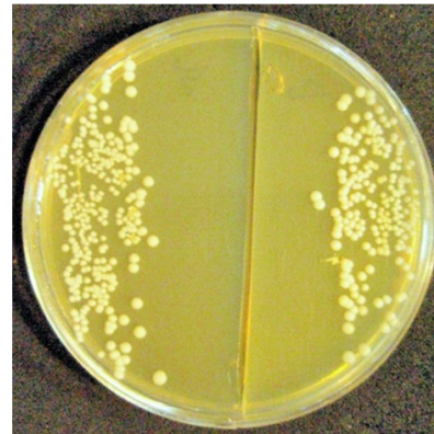
Figure 2: Colony count of C. albicans base of pure pale method

shaken for one minute with low circulation of vortex device (Behdad, Tehran, Iran) to allow the probable yeast cells adhering to the specimens be detached and suspended in the physiologic serum (Razi Vaccine and Serum Research Institute, Karaj, Iran). Subsequently, a certain amount (0.01 ml) of this suspension was cultured on the culture medium of Sabouraud-dextrose agar (HiMedia, Netherlands) with pour plate method [13]. The plates were placed in a 37°C-incubator for 48 hours. After the incubation time, the number of colonies was counted which was representative of the adhesion of C. albicans to the test specimens (Figure 2).