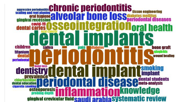
Figure 3: Author's used top-50 keywords graph generated by Biblioshiny Software.