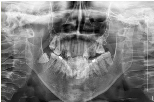
Figure 2: Panoramic x-ray.