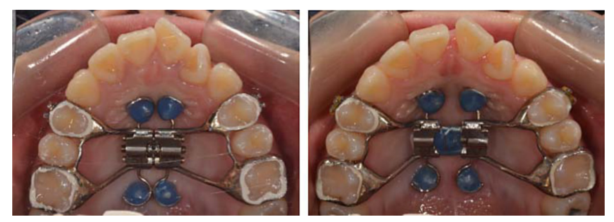
Figure 2: Mini-screw assisted rapid palatal expansion (MARPE) design.