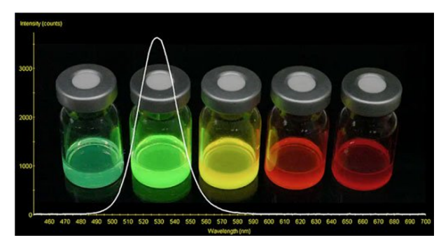
Figure 1: Vials of quantum dots producing vivid colors.

Despite the fact that the first quantum specks drew attention to their latent capacity, improving fundamental features, particularly colloidal dependability in a salt-containing arrangement, took a lot of effort. Initially, quantum specks were used in forgery circumstances, and these particles would have just encouraged in 'real' examples, as human blood. These difficulties have been addressed, and QDs have started a variety of applications in cancer biology (Figure 1) [3], [4].