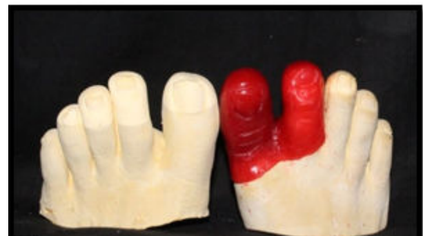
Figure 5: Wax-pattern for prosthesis.

The wax pattern was then adjusted by sculpting and adapted on the working cast. Approximate length and angulations were determined on working cast and later confirmed during trial of wax pattern (Figure 5). The wax pattern was tried on the patients affected foot (Figure 6).