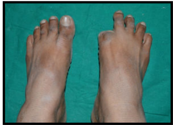
Figure1: Preoperative photograph showing missing hallux of right foot.

A male patient, aged 38 years, reported to the department, with a history of loss of right hallux (greater toe), about 3 years back, due to occupation-related trauma. Clinical examination of the affected foot revealed amputated hallux from metatarsal phalangeal joint (Figure 1). The surrounding area appeared to be normal with no signs of any infection. Glove type toe prosthesis was planned for the replacement of the missing hallux. After having informed consent from the patient, to ensure his willingness and cooperation the treatment was executed.