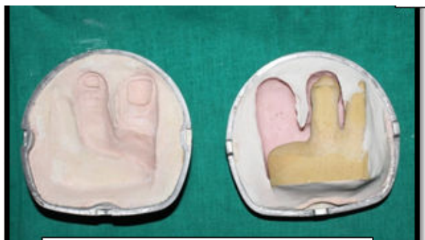
Figure 8: Dewaxing