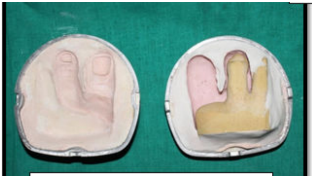
Figure 8: Dewaxing