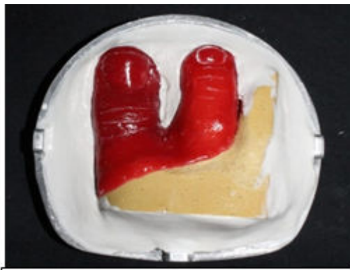
Figure 7: Flasking of the wax pattern.

was poured, wax was eliminated in the conventional way (Figure 8).