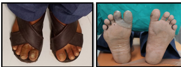
Figure 11: Final prosthesis after extrinsic staining