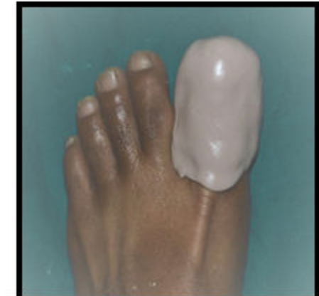
Figure 4: Putty and light body impression made of hallux of left foot.