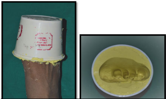
Figure 2(a and b): Impression making of the affected foot.