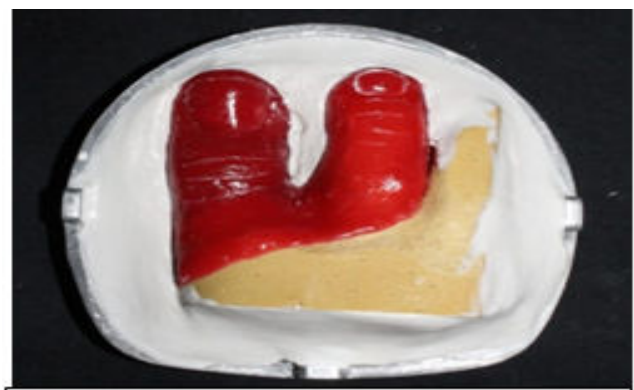
Figure 7: Flasking of the wax pattern.

The master cast was duplicated and the duplicate cast was used for investing. The pattern was sealed to the master cast at the junction, where the margins of the pattern overlapped the cast. The pattern and the cast were then invested in a large size flask [5]. The mold was first poured only up to half of the pattern (Figure 7). Separating medium was applied and then the other half was poured, wax was eliminated in the conventional way (Figure 8).