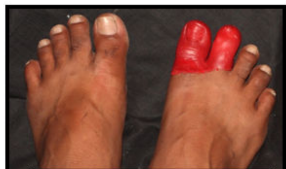
Figure 6: Try-in of wax pattern.