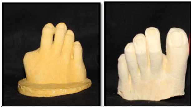
Figure 3(a and b): Stone model obtained of right (a) and left foot (b)

When the material was set the impression was retrieved and fabrication of model was carried out. Both the impressions were poured in stone plaster, type-III (Figure 3a and b). At the same appointment another impression was made of patient's left foot hallux in a combination of light body and putty (Figure 4). The impression of the patient's left foot hallux was poured with wax. The pattern was retrieved from the elastomeric impression [4].