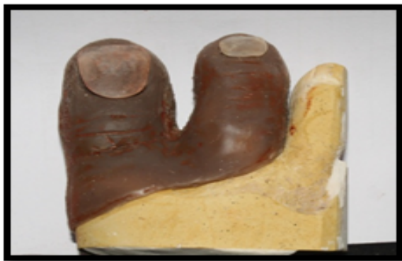
Figure 10: Final prosthesis