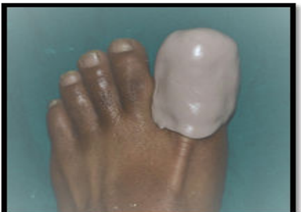
Figure 4: Putty and light body impression made of hallux of left foot.