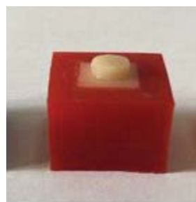
Figure 2: Study sample.

the ceramic-resin composite block was removed from the mold and the adhesive interface was exposed to additional 40 sec of irradiation Figure 2 [10].