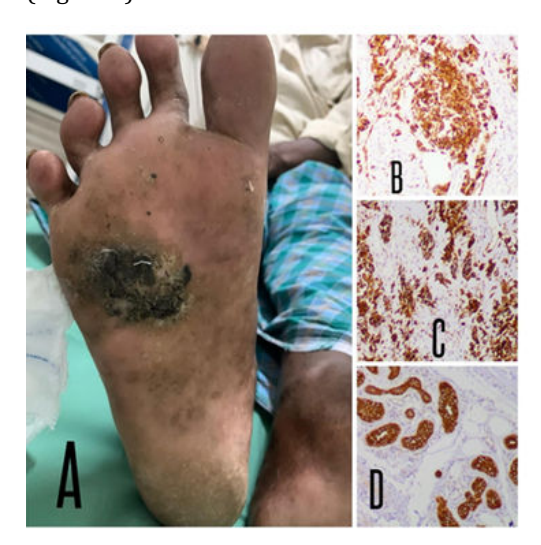
Figure 1: A-Clinical image of the right sole showing an irregular pigmented plaque with mild ulceration in the middle. B-Immunohistochemistry with strong Melan-A positivity. C- Immunohistochemistry with strong HMB-45 positivity. D- Immunohistochemistry with mild PANCK positivity.

borders and irregular pigmentation over the plaque (Figure 1).