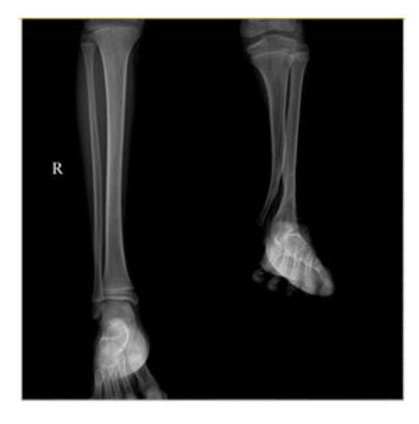
Figure 3: Pre OP Imaging (Right Side).