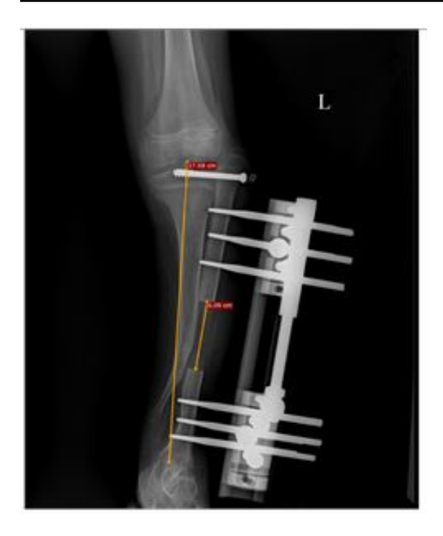
Figure 5: After 2 months: Lateral epiphysiodesis done in proximal tibia.