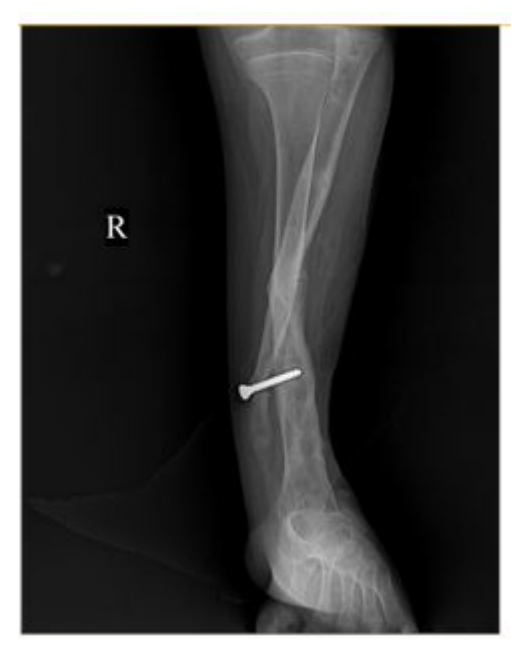
Figure 8: 2 months follow up.