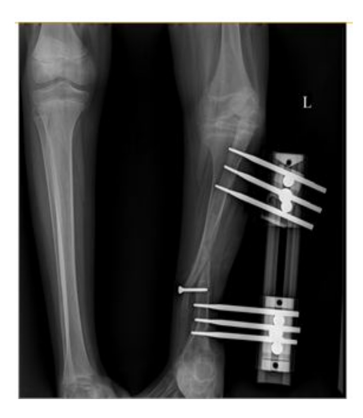
Figure 6: After 3 months: A tibiofibular synostosis was carried out using one screw.