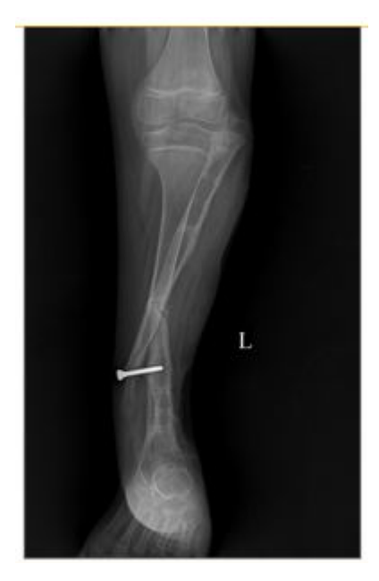
Figure 7: LRS was removed after 2months.