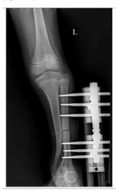
Figure 4: Surgical treatment.

According to type 4 Jones, we decided to treat the patient with fibular osteotomy under limb reconstructive system (Figures 4-8).