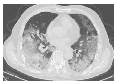
Figure 2: Severe type. A 66-year-old make was admitted to the hospital with cough and fever for a week. CT scan showed multiple ground glass opacity and consolidation shadows in both lungs, which were widely distributed in various lobed, especially sub-pleural.