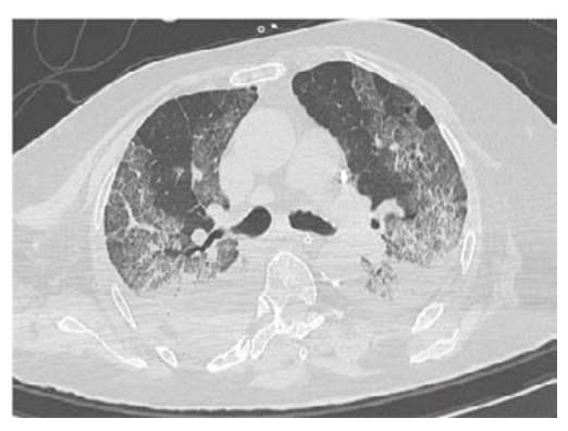
Figure 3: Severe type. A 77-year-old female had cough and fever for a month. CT on the 30th day after onset showed multiple ground glass opacity and consolidation shadows in both lungs with "crazy paving pattern".