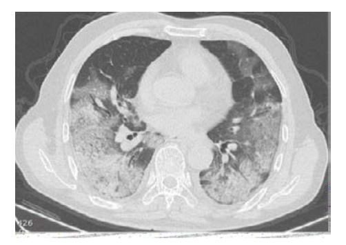
Figure 1: Severe type: A 48 - year- old male was admitted to the hospital with cough and fever for half a month. CT scan showed multiple ground glass opacity and consolidation shadows in both lungs with" crazy paving pattern " and" air bronchogram sign.

detected as novel corona virus 2019 or COVID -19 in patients Respiratory secretions and finally identified as the source of infection [1]. CT was used as a means of rapid diagnosis and disease progression and prognosis in Hubei, China, with lower mortality rate than other parts of the world. Widespread Use of CT is also advocated as the tool of quick diagnosis and control measure towards COVID -19 pandemic [2-4]. While other including the Fleischner society, recommend the use of CT in selected clinical settings [5,6]. Here we presented 5 severe cases of covid- 19 along with their characteristic CT findings (Figures 1 to Figure 5).