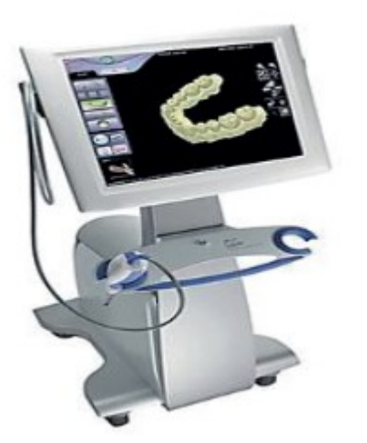
Figure 2: 3 M LAVA chairside scanner with computer and handheld software.