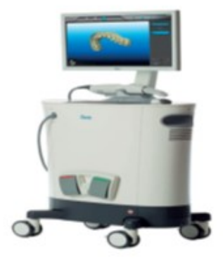
Figure 3: Cadentitero system.

Figure 2: 3 M LAVA chairside scanner with computer and handheld software.