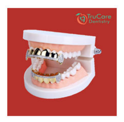
Figure 8: Dental grill on cast.