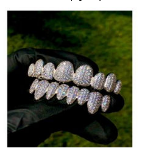
Figure 7: Dental grill.

Dental grills: They have a bit more bling than the various tooth stones. American rappers and hip-hop stars are the biggest fans of grills. It is something we have probably seen on television or in publications with a tooth accessory like this (Figure 7). They are usually made of metal, like gold, and can also hold valuable stones like diamonds. They typically cover the whole front area of the dentition, although the material, location, and design are all distinctive to an individual. It is a style for some, despite the fact that it is a striking addition to the smile (Figure 8).