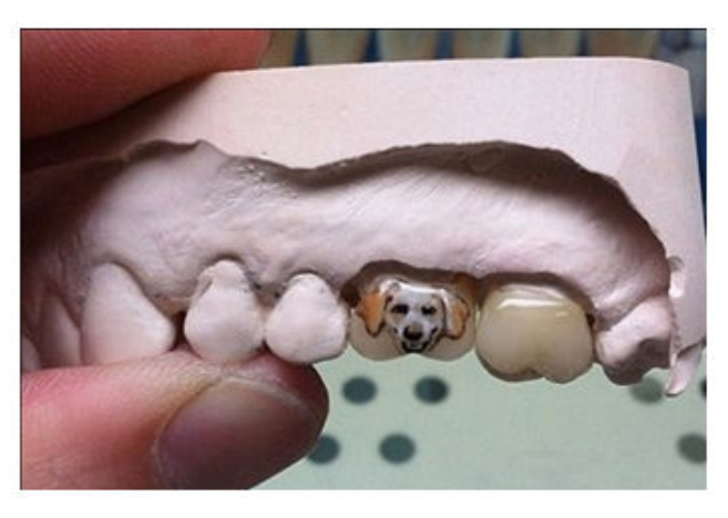
Figure 6: Tooth tattoo on cast.

Dental grills: They have a bit more bling than the various tooth stones. American rappers and hip-hop stars are the biggest fans of grills. It is something we have probably seen on television or in publications with a tooth accessory like this (Figure 7). They are usually made of metal, like gold, and can also hold valuable stones like diamonds. They typically cover the whole front area of the dentition, although the material, location, and design are all distinctive to an individual. It is a style for some, despite the fact that it is a striking addition to the smile (Figure 8).