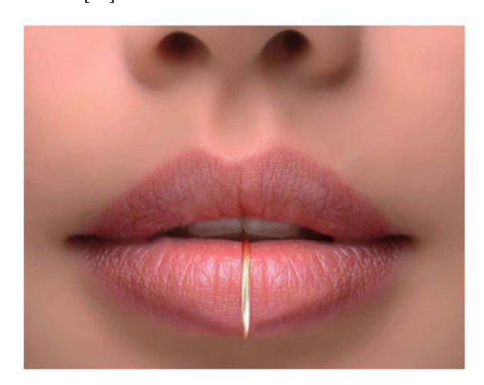
Figure 12: Lip-piercing.

Lip and cheek piercing: People are using their hands on piercing since ages and is still practiced across the globe. Wooden plugs are placed in the lips of women by their husband of the African tribe named Makololo as a symbol of possession, and it is viewed as a mark of great beauty by the tribe's members. The position of the jewellery in a cheek or lip piercing is generally decided by aesthetics (Figure 12), with consideration for where the piercing will be placed inside the mouth. Once the site has been chosen, a corkscrew is repeatedly placed in the oral cavity to support the tissue as it is penetrated using a needle (Figure 13). The needle goes through the tissue and into the cork backing. The disc is then screwed into place, and the needle is restored with the labret stud. And the time taken by the body to heal is from weeks to months [17].