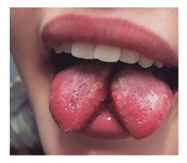
Figure 11: Tongue split.

Lip and cheek piercing: People are using their hands on piercing since ages and is still practiced across the globe. Wooden plugs are placed in the lips of women by their husband of the African tribe named Makololo as a symbol of possession, and it is viewed as a mark of great beauty by the tribe's members. The position of the jewellery in a cheek or lip piercing is generally decided by aesthetics (Figure 12), with consideration for where the piercing will be placed inside the mouth. Once the site has been chosen, a corkscrew is repeatedly placed in the oral cavity to support the tissue as it is penetrated using a needle (Figure 13). The needle goes through the tissue and into the cork backing. The disc is then screwed into place, and the needle is restored with the labret stud. And the time taken by the body to heal is from weeks to months [17].