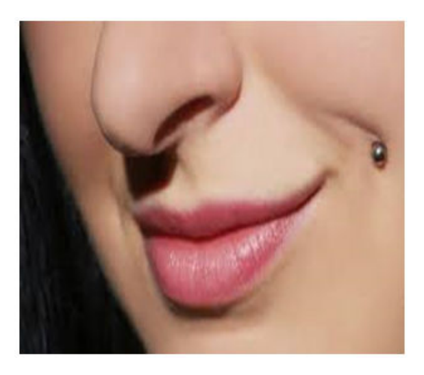
Figure 13: Cheek piercing.