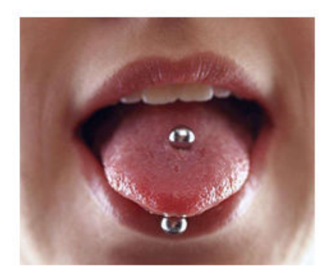
Figure 10: Tongue piercing.

Tongue splitting: Some people believe tongue splitting as a sort of body art. The procedure splits a tongue of a person in half, giving them a "forked" appearance. Laypeople split languages using a variety of rudimentary procedures. Without anesthetic, a knife and cauterizing pen, for example, could be used, or a fishing line could be passed through the punctured tongue and pushed forward, severing the front part. Individual pulls the two tongue segments away on a frequent basis to keep the split from "healing" back together (Figure 11). Additional surgery to correct the "split" may be required once the wound has healed.