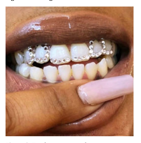
Figure 2: Tooth gems on teeth.

Twinkles/tooth studs: Twinkles/tooth studs are designed to be glued to the enamel of tooth, and their distinct backside is comparable to the brackets of orthodontics, allowing them to rest in place for a long time. These are pieces made of 24 carat gold and white gold that come in 50 distinct designs, some of which include diamonds, sapphires, and rubies. The twinkles that are available are: twin dent AB, Uppsala, Sweden. Upper incisal and canine teeth are the most typically used teeth for attachment (Figure 3). Gold, precious stones like diamond, sapphire and ruby are used to make twinkles same as tooth gems it painless, harmless procedure requiring only 10-15 minutes [14].