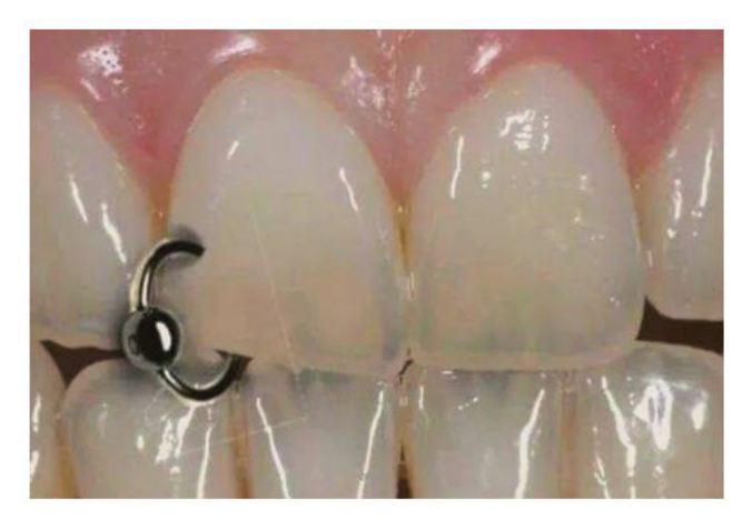
Figure 4: Tooth ring.

Tooth rings: In this a small hole is drilled near the distoincisal section of the upper central tooth and the tooth ring is suspended in it. The maxillary central incisors are the most usually utilized desired teeth, and the amount of the hole is determined by the width of the ring chosen. The hole should be polished and prepared in the most efficient manner feasible. Precious stones can also embedded in this rings (Figure 4). The available overjet should be taken into account while choosing the ring diameter to avoid occlusion interference. The rings can be created to connect the two central incisors or the central incisor to the lateral incisor in some cases [15].