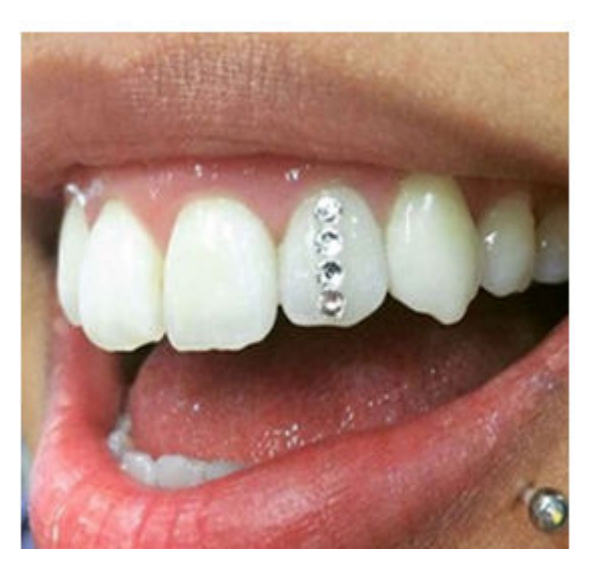
Figure 1: Tooth gems on tooth.

and it can be straightly adhered to the enamel of tooth [13]. Two different diameters are available in these crystal glass stones, they are: 1.8 millimetres and 2.6 millimetre. Rainbow gemstones are the most affordable. They are great for short-term use because they are made economically in mind. Rainbow crystals can be obtainable in ten various hues and two sizes (1.8 mm and 2.5 mm).