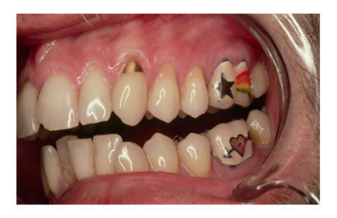
Figure 5: Tooth tattoo intraorally.

Tooth tattoo: It is also referred to as dental tattoo which is actually a misnomer as 'Tattoo' is made by piercing the skin making pigment marks. But in case of tooth tattoo the needle touches the enamel only. Tooth tattoos are personalized graphics that are applied on dental crown before they are sealed and placed on tooth/teeth. Tooth tattoos come in a variety of styles, colours, and designs and can be put on any tooth (Figure 5). The interested group ranges from 14-35 years [11]. Celebrities, flowers, religion, loyalty to a person or subject, and animals are just few of the tattoo categories that are employed as dental tattoos. Temporary tattoos can also be applied; these are usually developed in the form of stencils that are attached to the teeth. It only takes 15-20 minutes to apply a temporary tattoo (Figure 6). It is an indirect method that necessitates tooth reduction in order to place the crown. Dental tattoos were born as a result of modern dentistry. Dental tattoos became popular a decade ago, when hip hop performers and rappers began wearing them in their music videos [16].