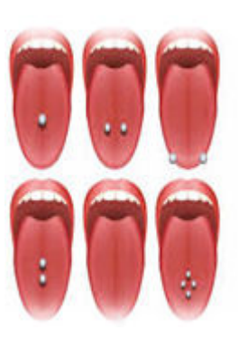
Figure 9: Different positions of Tongue piercing.

placed ventral-dorsally into the pierced part (Figure 9). Between the intermaxillary anterior teeth, the dentist grasps the open end of the jewellery and screws the ball onto the stem (Figure 10). The twinkles present on the lingual surface of the dorsolateral end can also be used to insert the barbell laterally. Healing takes 4 to 6 weeks in the absence of complication.