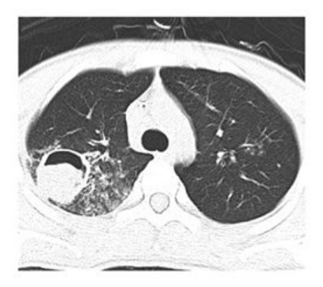
Figure 6: It exhibits the air crescent sign, cavitation in the right upper lobe and in the left upper lobe there are nodules of various sizes.

Gastrointestinal mucormycosis: It is generally considered to be rare and is secondary to the ingestion of fungi. The stomach, colon, and ileum are the most prevalent sites of gastrointestinal mucormycosis and stomach being the most common. GI mucormycosis has also been reported in conjunction with other immune compromising illnesses such as AIDS, systemic lupus erythematosus, and organ transplantation in extremely rare occurrences. The features of gastrointestinal mucor cases vary depending on the site of infection. The most common symptoms are nonspecific pain in the abdominal and abdominal distention, as well as nausea and vomiting. Fever and hematochezia are also possible side effects. There has also been an intra-abdominal abscess discovered [7-10].