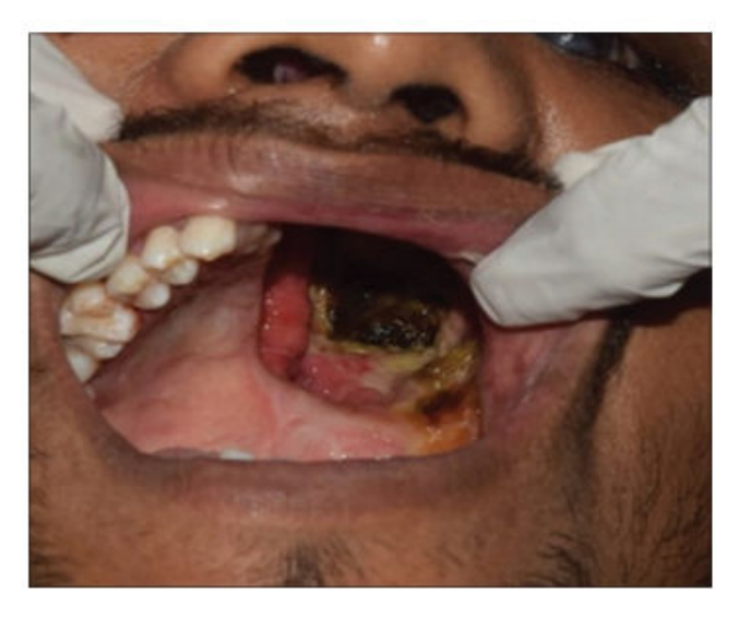
Figure 4: Rhino maxillary mucormycosis.