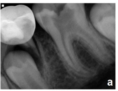
Figure 1. Preoperative IOPA radiograph

Diagnosis and treatment planning: Based on the clinical and radiographic examinations, the patient had irreversible pulpitis in relation to tooth #36. After discussion with the parents, it was decided to do vital pulp therapy to promote apexogenesis followed by the placement of stainless steel crown. The parent signed the informed consent form before proceeding with the treatment.