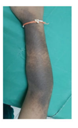
Figure 2: Clinical image showing pigmented patch with irregular borders and localized hypertrichosis.