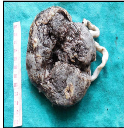
Figure 1: Retro placental hematoma.