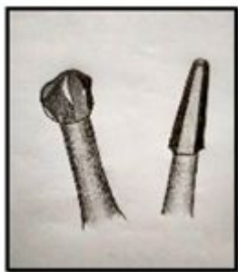
Figure 6: Endoguide burs.