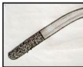
Figure 4: CVD burs.

ultrasound, there is only a slight touch for tooth grinding, whereas conventional rotating techniques promote unnecessary tooth grinding (Figure 4).