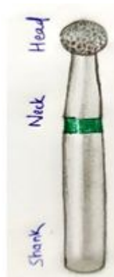
Figure 1: Showing parts of dental bur.

Parts of the dental bur are head, neck, and shank (Figure 1). Bur head has evenly spaced blades having concave areas, i.e., chip or flute spaces in between them. There are 6 to 8 to 10 blades on the cutting bur, whereas on a finishing bur, 12 to 40 blades present [10].