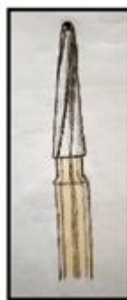
Figure 7: Endo Z burs.