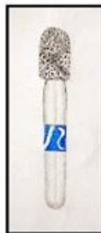
Figure 9: Single use burs.

about infection control [42] (Figure 9). Manufacturers claim that rather than sterilization discarding a single use bur is much more economical.