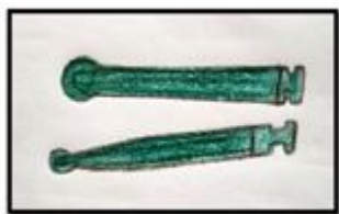
Figure 2: Polymer burs.