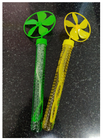
Figure 1: Fancy soap bubble toy.

Deep breathing exercise was taught to the children as to inhale deep breaths from the stomach and slowly exhale as if blowing the air out until asked to stop. After repeating this several times till the child got used to the breathing exercise, the subjects were made to blow the bubble blower using the same breathing pattern, blowing a large bubble without breaking it. The children were encouraged to blow big bubbles by inhaling deeply and exhaling them into bubbles which were repeated for 10 times (Figure 2). The parents were made to observe this learning and a one-week chart was given to the parent. The parent had to make the child do this exercise daily at home for ten times for a minimum of four continuous days before the next appointment. The children who were allocated in the control group were not taught about this breathing exercise and were not provided with any soap solutions.