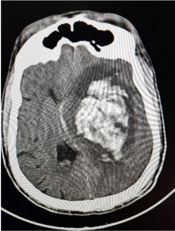
Figure 1: ICH bleed.