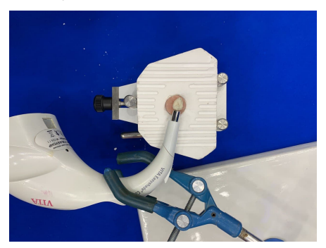
Figure 2: Color measurement

\Delta E of each group was compared with those of the others, to distinguish which type of adhesive removal procedures was more unstable in color, and to evaluate the effectiveness of Sof-Lex polishing discs on tooth color stability.