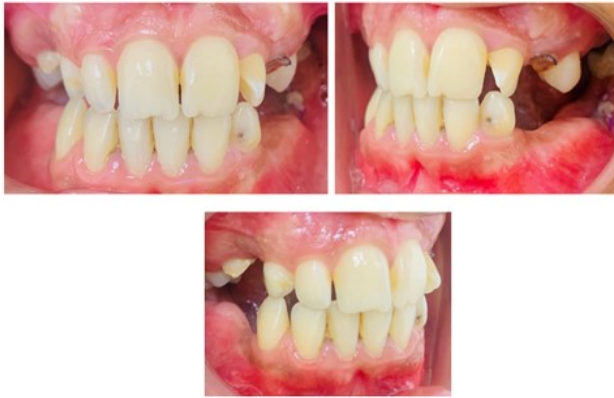
Figure 1: The intraoral examination showing the absence of teeth.

The teeth with caries are numbered as follows: 16, 28, 36, 37, and 47. The primary teeth that were kept are numbered 53, 55, and 73, while the surviving root of primary tooth 63 was also retained. The individual had inadequate oral hygiene, resulting in the buildup of plaque. Tooth 16 exhibited caries and was non-vital. The intraoral periapical radiograph revealed the presence of periapical rarefaction (Figure 2).