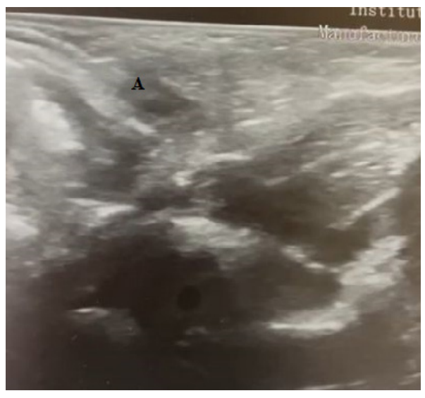
Figure 2: Ultrasonography image at a right inguinal swelling in a 2.5-months-old female baby demonstrating a hypoechoic oval structure indicating the ovary with multiple small cysts indicating follicles (A).