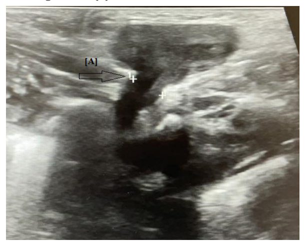
Figure 3: Ultrasonography image at a right inguinal swelling in a 2.5-months-old female baby demonstrating an irreducible right inguinal hernia with about 7mm hernia neck. [A] Arrowed.