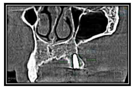
Figure 2: Coronal view of CBCT to demonstrate the bone level in relation to the implant.

For both groups (flapped and flapless surgery) the patients were subjected to CBCT examination with (KAVO OP 3D; Germany) in the same operation day immediately after surgery to determine the marginal bone level as a baseline data be measuring the distance between the apical part of the implant and the margin of the crest in two views (coronal and sagittal) as demonstrated in Figure 2. The patients were allocated to the early loading protocol depending on the measurement of stability values after 8 weeks of implant placement, in which ISQ 57-80 is considered suitable for successful implants [9].