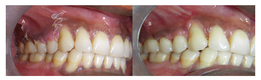
\label{thm:continuous} \textbf{Figure 3A: Uneventful healing at 15 days post operatively.}