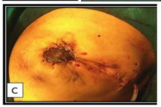
Figure 1: A. Patient presented with breast lump and multiple scar marks from previous drainage. B. Donut mastopexy with lateral extension was performed. C. Post op appearance in the same patient.