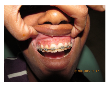
Figure 1L: 2 Weeks postoperative view.