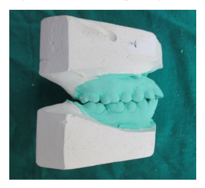
Figure 2D: Cast (Lateral view).