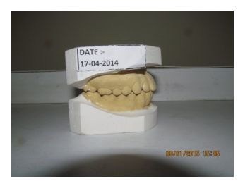
Figure 1D: Cast model (Lateral view).