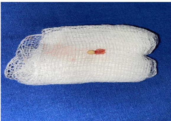
Figure 4: Salivary gland calculi.