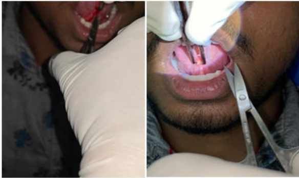
Figure 2: Intra Op view.