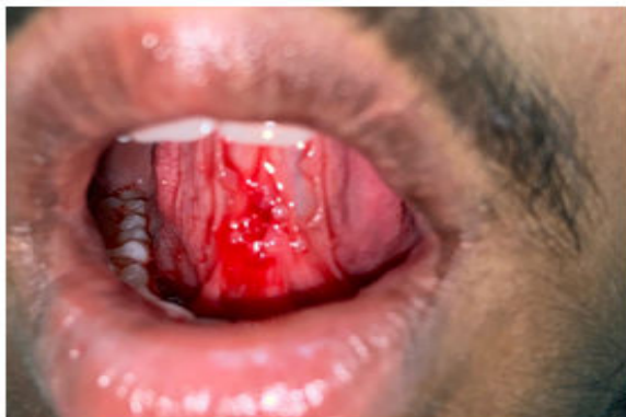
Figure 3: Post Op view.