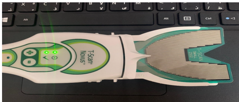
Figure 1: T-Scan NOVUS device.

One hundred and nine (109) subjects were participated in this study with age range (19-45 years old) and divided into two main groups: study group (show signs and symptoms of internal derangement ID) with (84) patients (64:20 females: male number) and (25) healthy controlled free from signs and symptoms of TMD with (14:11 female: male number). Table 1 illustrated the demographical characteristics variables, as well as comparisons significant of