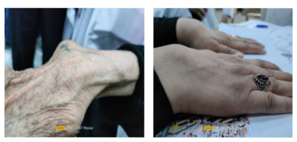
Figure 3: Some enrolling patient in our study that shown swelling joint.