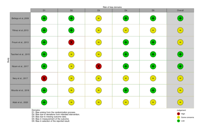
Figure 2: Risk of bias.

The results of the bias assessment of the included studies are presented in Figure 2. Robvis was used to create the plot [21]. No studies obtained the highest score in the quality analysis. Two studies reported adherence to the CONSORT statement recommendations [15,18].